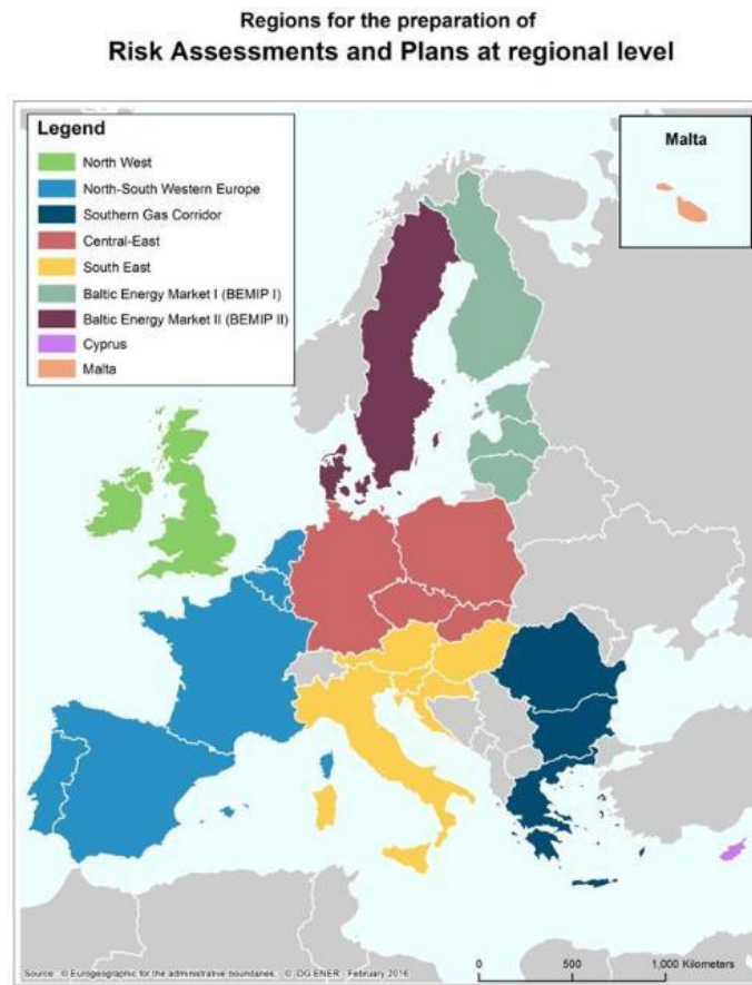
Figure 2. Proposed regional groupings within the EU. 14

In order to produce a more coordinated approach to the security of gas supply in the EU that takes into account the existential differences between Member States, cooperation at the regional level can be considered critical. This is also supported by the industry, as shown by the responses to the public consultation carried out by the EC. 15 A common assessment of the risks among Member States is clearly needed in order to properly evaluate the potential risks of disruptions at a regional level and to establish common assumptions. From this perspective, the proposal to adopt a coordinated approach to security of gas supply at a regional level is helpful and will undoubtedly benefit the security of gas supply at the EU level. However, the current proposed composition of the regions does not seem to coincide sufficiently with reality on the ground. A good example is that of the region of North- and South-West Europe, which the EC has compiled based on the fact that all countries have so-called mature markets. Its composition raises several questions.